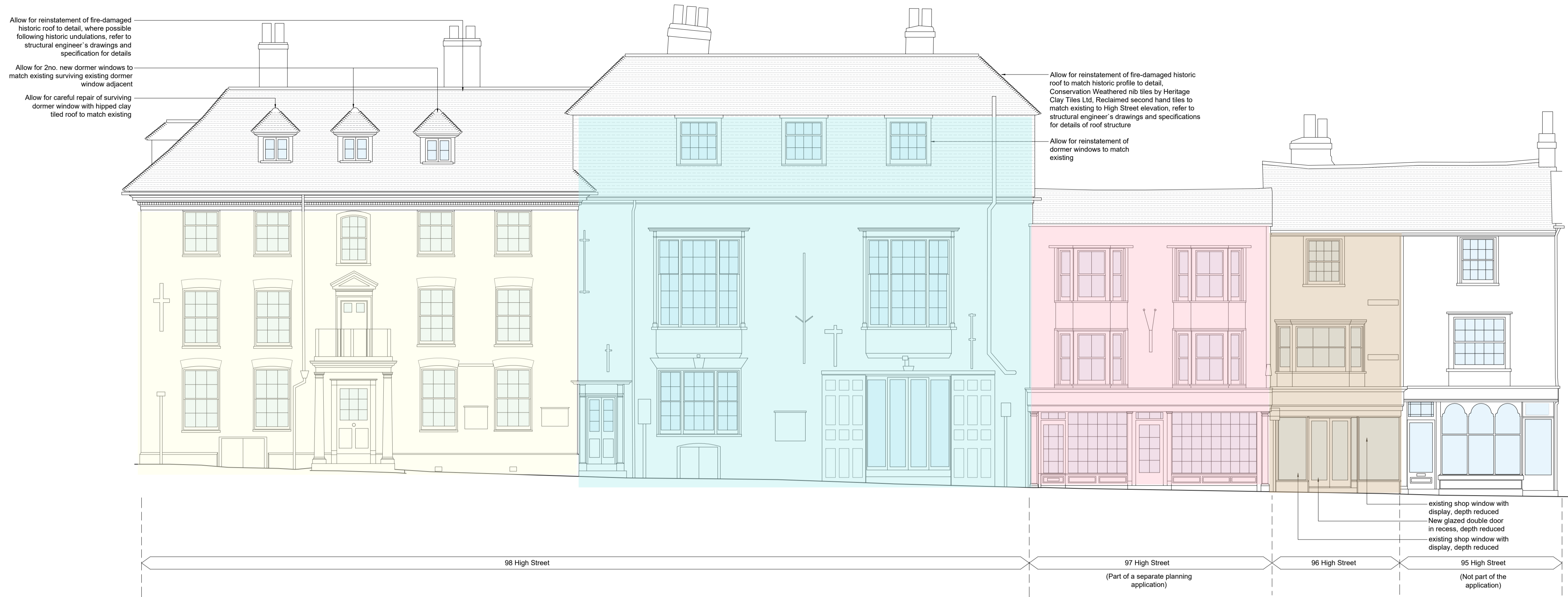
Proposed North Elevation ( High Street)

External decoration to express different buildings on the site (Colours shown below are NOT proposals but indicate the different buildings)