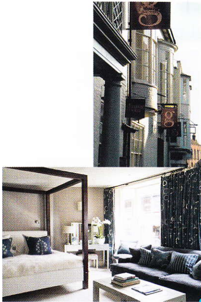
The luxury double room at The George In Rye (above); The Ship Inn's egg and soldiers breakfast (below)