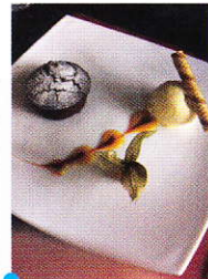
Tuscan Kitchen Rye's tortino al cioccolato dessert (left)