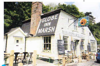
The Globe Inn Marsh, named one of the best pubs in the country by the Telegraph