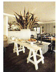
The dining room of The Gallivant, Rye's refurbished motel by the sea